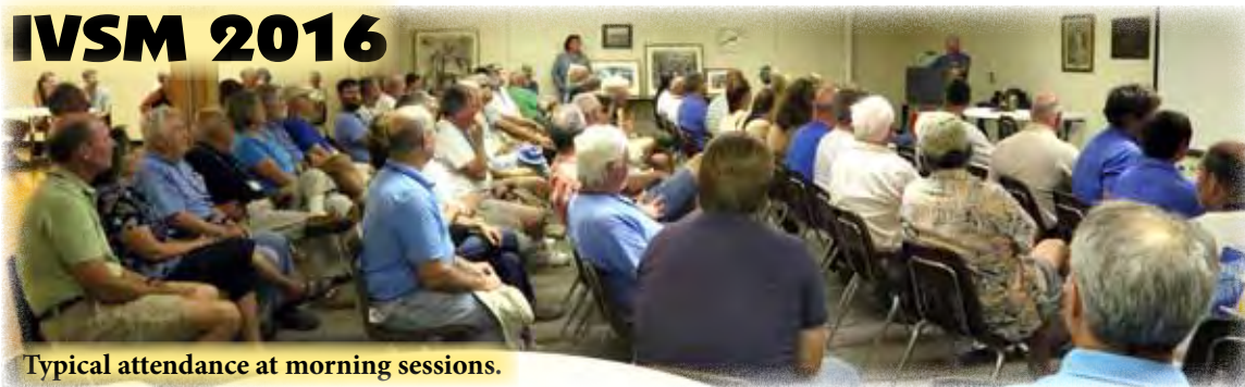
Typical attendance at morning sessions.

In past years it was often heard that there was “nothing to do” for those standing on the ground throughout the week-long event. This year, it was often heard that there was too much going on. For those who could not come to Elmira, here are some highlights in retrospect.