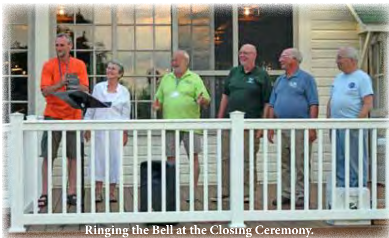
Ringling the Bell at the Closing Ceremony.

Closing Picnic and Awards Ceremony at the Harris Hill Youth Camp. This event was a “Thank You” for all participants for coming, but also for the hard working NSM staff and HHSC members for making a memorable meet. International participants once again rang the VSA cowbell, marking the close of the event.