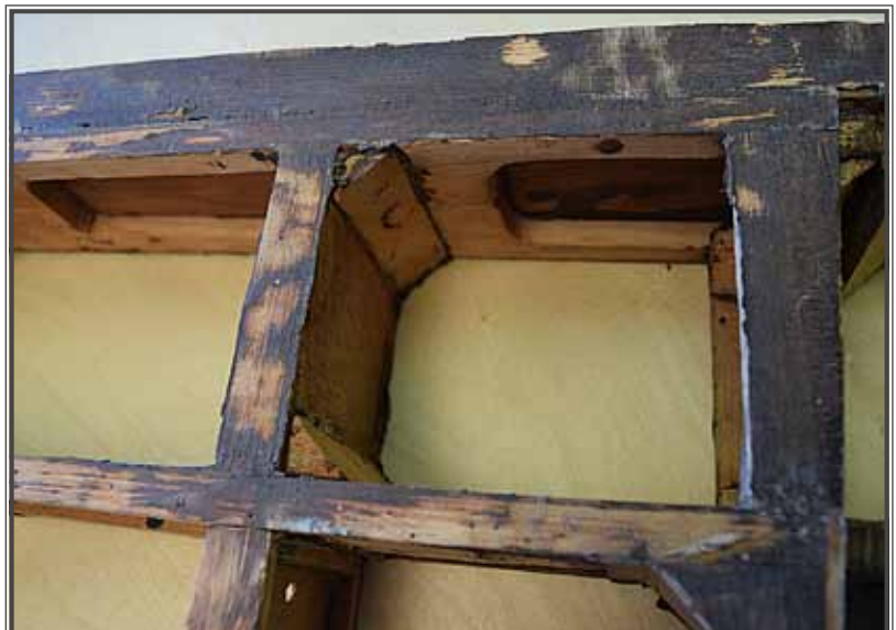
The lower fin/fuselage structure of the Lo-150 with the skin removed. The dark color is the remaining Aerodux glue.