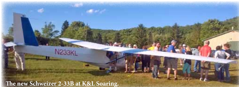
The new Schweizer 2-33B at K&L Soaring.

Opening Ceremony with the traditional ringing of the cowbell, followed by a museum tour and wine tasting.