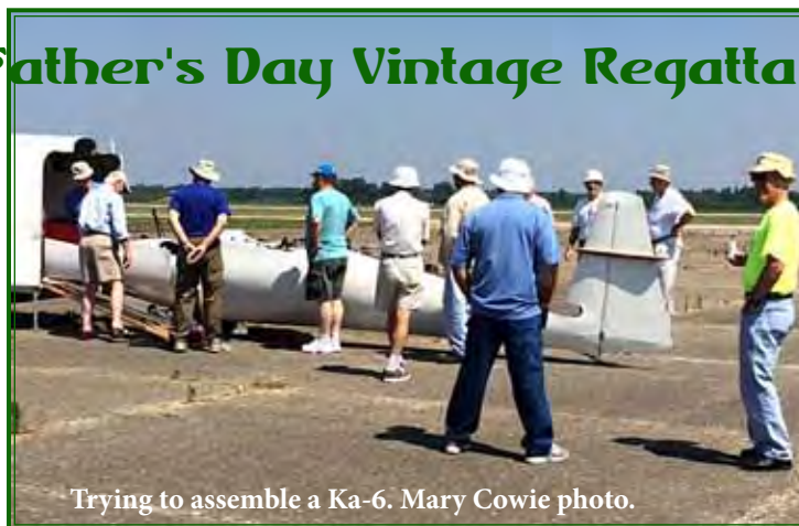
Trying to assemble a Ka-6.