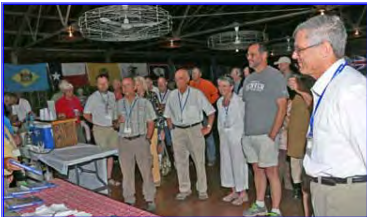
Workshop Practice Debut at International Night.

entice VSA members to buy their own copies. The book can be purchased via the VSA website < www.vintagesailplane.org/classifieds/books/ > ($47 plus $6 P&H to a US address and $30 P&H to a non-US address), from Cumulus Soaring < www.cumulus-soaring.com/books/WorkshopPractice/WorkshopPractice.htm > or from EQIP < www.eqip.de/index.php/en/shop-englisch/product/view/10/55 > in Europe.