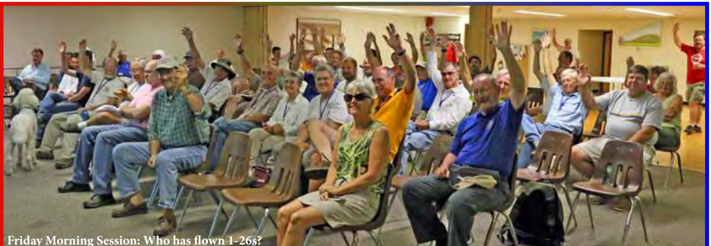
Friday Morning Session: Who has flown 1-26s?